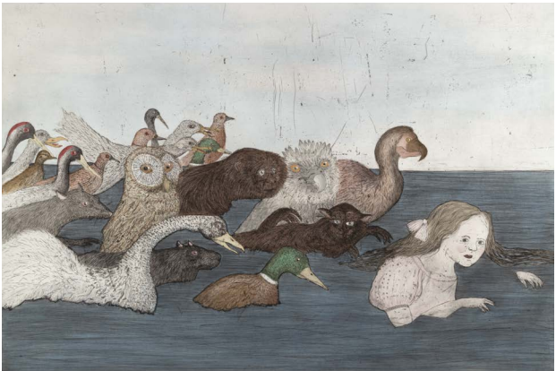
Kiki Smith, Pool of Tears II, 2000.

Experience the unique vision and invention of prolific artist Kiki Smith (b. 1954, Nuremberg, Germany, lives and works in New York, USA). This exhibition focuses on three distinctive areas of her practice: the intricate Jacquard tapestries produced since 2012; small sculptures created from the mid-1980s to the present day; and a selection from her innovative printmaking practice.