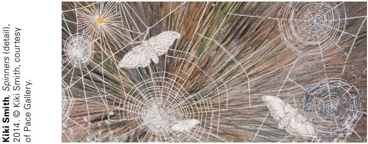
Kiki Smith, Spinners (detail), 2014.