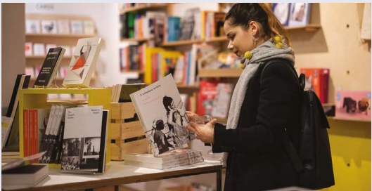
Modern Art Oxford’s Shop.

Modern Art Oxford’s Shop is the perfect place to pick up unique gifts, art books, toys, jewellery and stunning pieces by local designer-makers. Inspired by Kiki Smith’s exhibition? Take home a memento by purchasing exclusive merchandise including bags, postcards, notebooks and greetings cards. Find out more by following @mao_giftshop on Instagram.