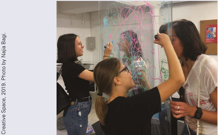
Creative Space, 2019.

Activity sheet Our activity sheets provide fun and informative activities for children and families that are linked to our current exhibition. Pick one up for free from our Information Desk or Shop.