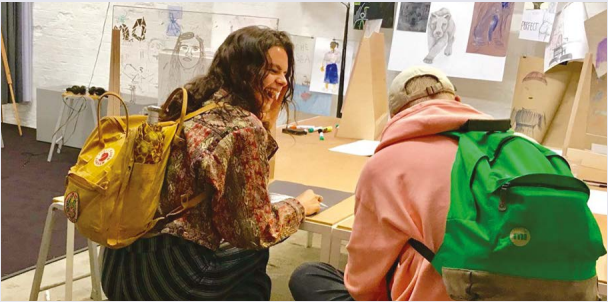
Creative Space, 2019.

Our Creative Space offers visitors and their friends and family the opportunity to have their own creative experiences. Every weekend between noon and 4pm, our friendly art practitioners will be here to help visitors create their own artworks. This autumn the Creative Space will host our annual graduate exhibition Platform before being transformed into a space exploring the storytelling and digital weaving that is so central to Kiki Smith’s work.